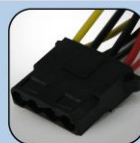
4 Pin Connector (IDE)