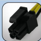
P4 Connector (CPU)